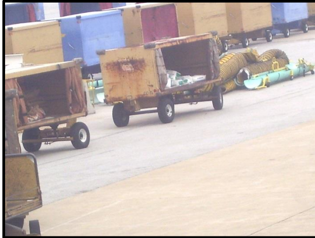
Airport Baggage Cart